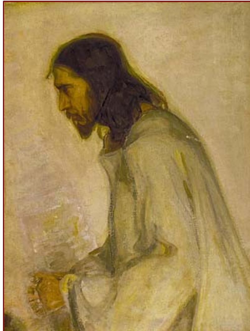
"The Savior" Henry Ossawa Tanner 1859 - 1937

On his word I'm feeding, I shall not be moved; He's the one that's leading, I shall not be moved, Just like a tree that's planted by the waters, Lord, I shall not be moved.