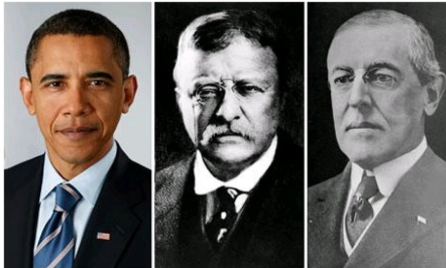
Three Sitting Presidents who received the Nobel Peace Prize