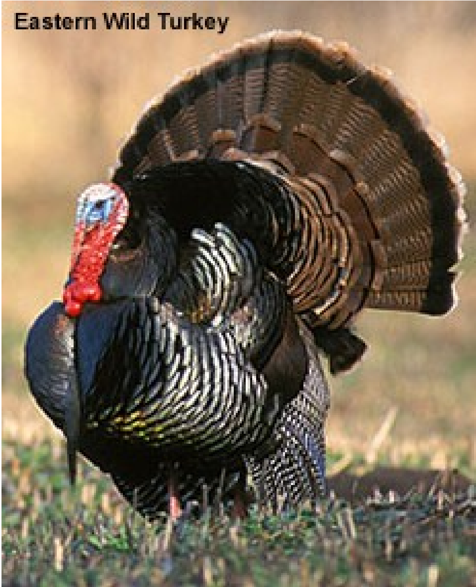
Eastern Wild Turkey

While we sit and eat our Thanksgiving dinner, let us not forget the reason for the holiday. We are here to give thanks for all of the blessings that God has given us. We need to remember the Pilgrim Puritans who first came to this land to escape religious persecution in England.